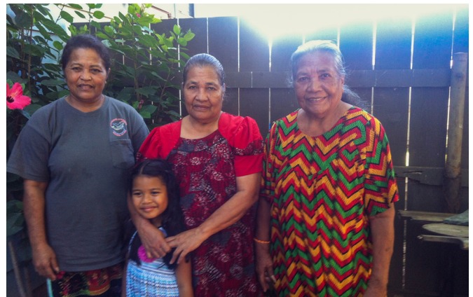
Respondents in Hawai'i