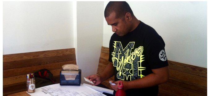
Respondents in Hawai'i